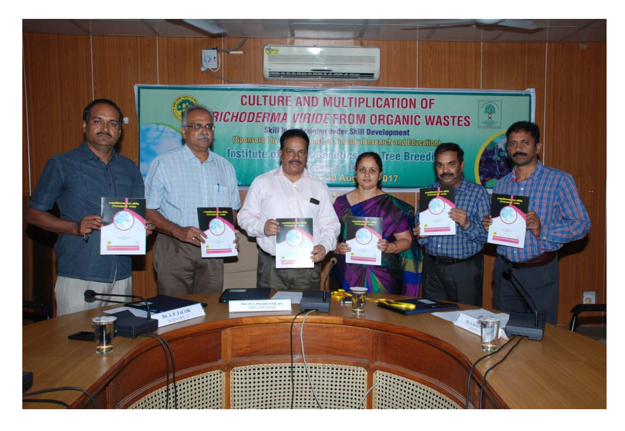
Release of Trichoderma viride brochure