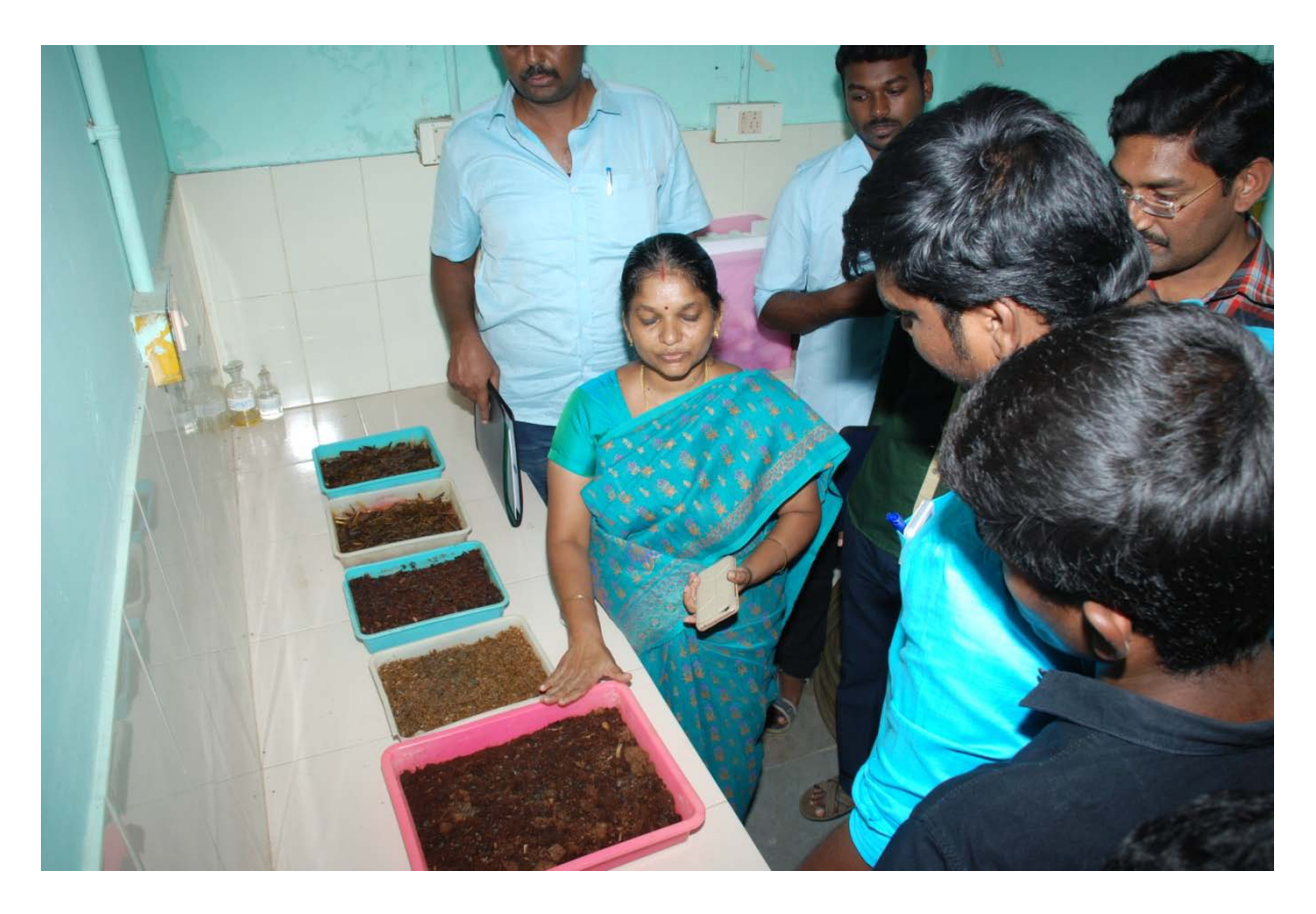
Multiplication of T. viride in organic wastes