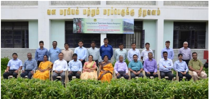
Group photo- IFS training 2022 at IFGTB