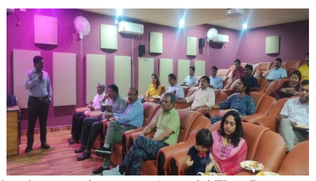
Address by Field Director, Anamalai Tiger Reserve & Visit to interpretation centre, Anamalai Tiger Reserve