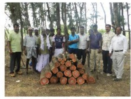
Pulpwood logs from a single tree measuring girth of 82.5 cm

The plantation was raised at a spacing of 4' \times 4' ( 1.2m \times 1.2m ) amounting to a density of 2778 trees per acre. Some deviations in the planted spacing were observed; however, average spacing worked out to 1.2 \times 1.2m . The casualty amounted to an average of 67%. There existed huge variation in girth of trees varing from 15 to 90 cm with a very few exceptional trees measuring up to 108 cm. Hence, the trees were stratified into five girth classes and frequency distribution of trees in different girth classes was