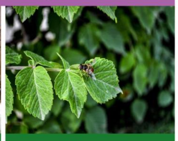
Crucial for agriculture