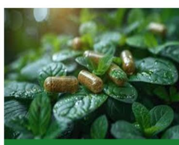
Vital sources of medicine