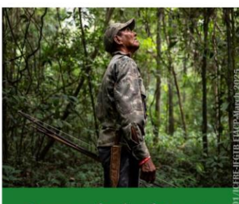
Serve as food safety nets in times of crisis

"Forests & Foods: Rooted in Nature, Feeding the Future"