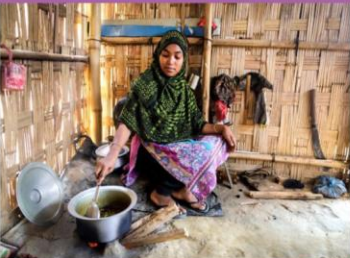
2 billion peoples rely on wood and other traditional fuel for cooking