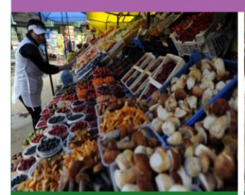
Provides foods for billions of people

Forests sustain life, nourish communities and safeguard our future